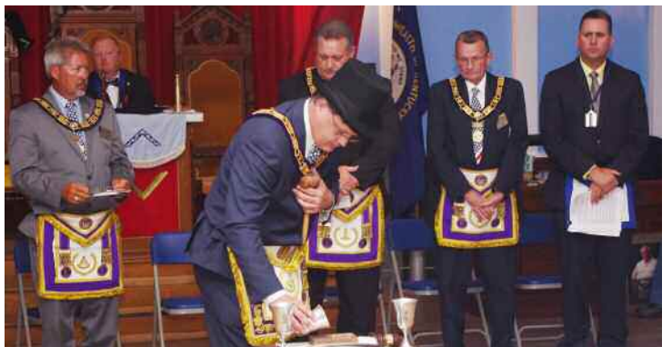
The Grand Master (center) and Grand Line Dedication Ceremony