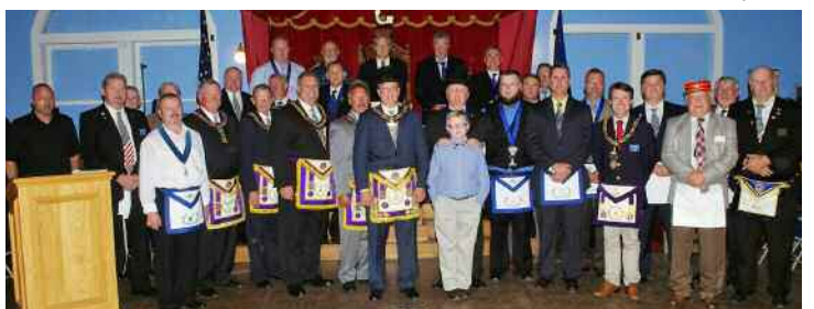
Attendees of Dedication Ceremony