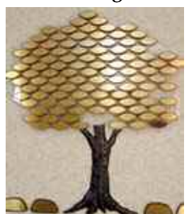
The Giving Tree will support initiatives at the Shelbyville Home and also honor special individuals or events.

A new tree has taken root in the Masonic Home of Shelbyville.