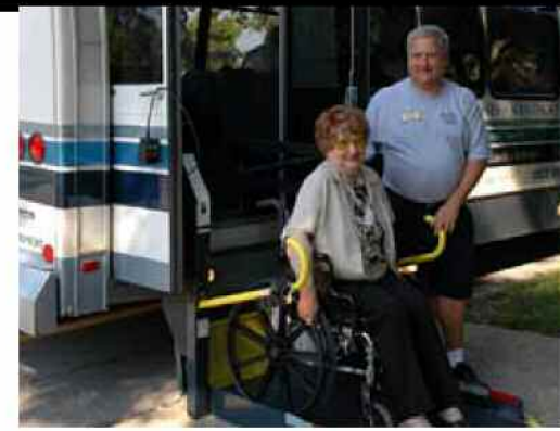
Masonic Homes of Kentucky vehicles like this one were donated by the St. John's Day League.