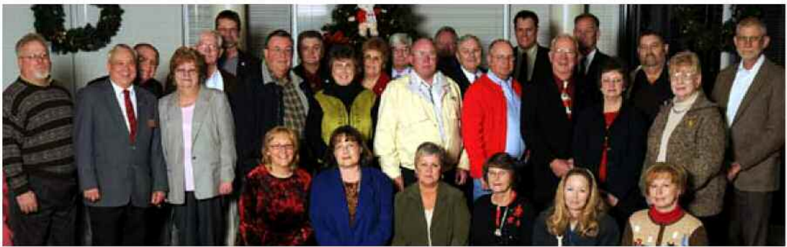
The Masonic Homes' first District Ambassadors and their spouses visited the Masonic Home of Shelbyville as part of their orientation.

Ambassadors answer the call for Masonic Homes