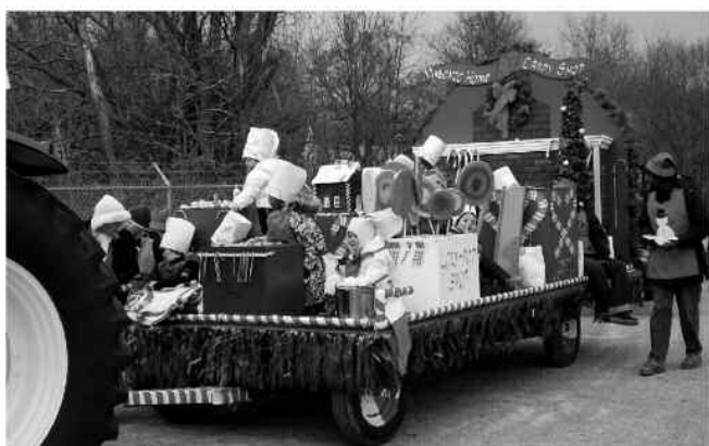
Masonic Home of Shelbyville residents, employees and their families brought the Candy Land Express to Shelbyville's annual Christmas parade, winning second-place honors from the Chamber of Commerce.