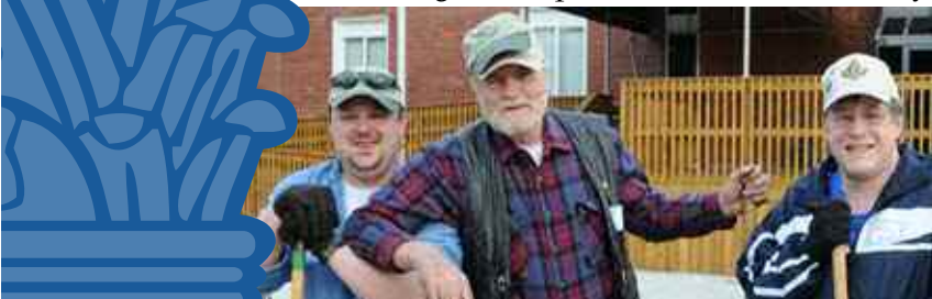
Above : Members of W.G. Simpson No. 472 deared a plant bed on the Shelbyville campus.

More than 300 volunteers planted bushes, cleared flower beds, trimmed trees and even built a new gazebo April 19<sup>th</sup> at the fifth Great Day of Service.