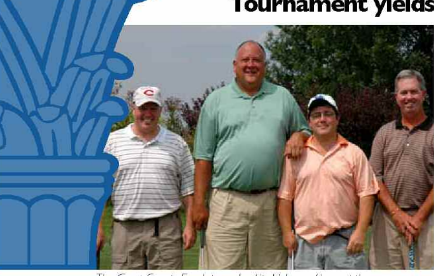
The Grant County Foods team had its highs and lows at the Grand Master's Tournament.