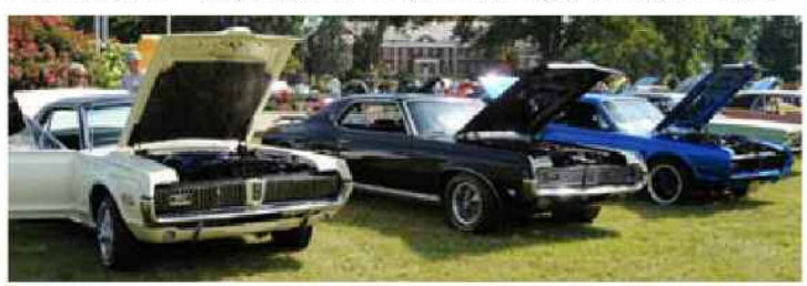
The Kentuckiana Cougar Gub held a Cougar and Classic Ford auto show on the Louisville campus on August 16. More than 100 cars drew a steady stream of vehide lovers throughout the day, and delighted Masonic Horne residents and staff. The Gub has already booked its 2009 show on the Louisville campus.