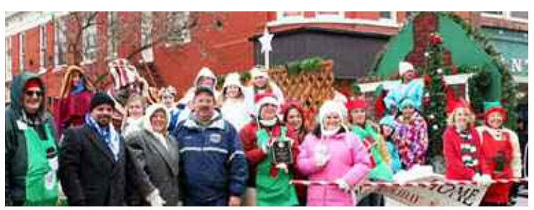
The Masonic Home float won first place for business and industry in the annual Shelby County Christmas Parade. With the theme What Christmas Means to You many employees and their families rode on the float or walked along side tossing candy to the arowd.