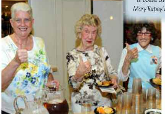
Village residents gave Club Olmsted a thumbs-up.