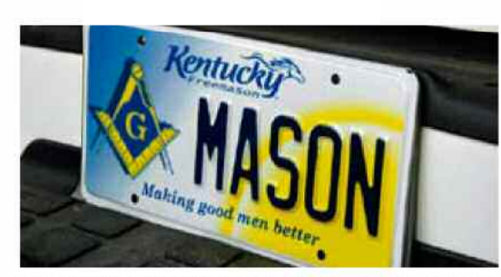
Masons who request the specialized Masonic license tag can make a voluntary $10 donation to the Homes,

When renewing your vehicle license, please make the Homes your #1 resolution for 2011.