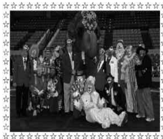
Ticket Prices $16 * $18 * $22

Thurs & Fri: 10:30 & 7:00 Sat & Sun: 10:00, 2:00 & 7:00