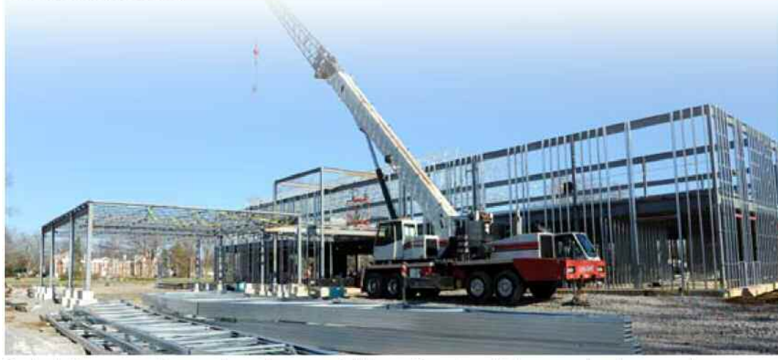
The Louisville campus will soon welcome the return of children to Sproutlings, offering comprehensive care and development programs for children of all abilities.

Families can apply now for services online at www.sproutlingsdaycare.com or call 502/753.8222 for more information.