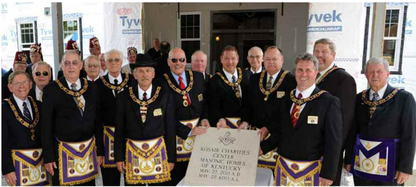
Grand Lodge officers posed with the cornerstone after the ceremony.

More than 150 people witnessed the ceremony and enjoyed hard hat tours of the inside. Construction is expected to be completed this summer, and the center will be welcoming children this fall.