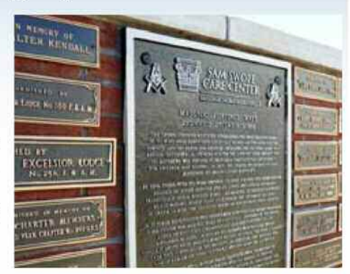
Bronze plaques from the old St John's Day League Infirmary have been mounted in the Legacy Garden at Sam Swope Care Center.

I want you to have the same opportunity to support the Masonic Homes of Kentucky and more importantly our residents as we move into a new era of caring. Please consider purchasing a brick, paver or limestone