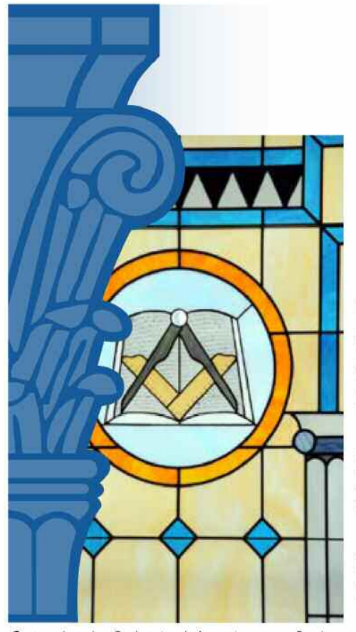
Custom handcrafted stained glass pieces are focal points in Sam Swope Care Center's new chapel.