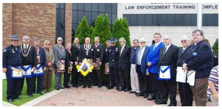
Masons from various parts of the state attended the Law Enforcement Ceremony to honor their fallen Brother Masons.

The Grand Lodge of Kentucky was well represented at the Law Enforcement Memorial in Richmond, Kentucky.