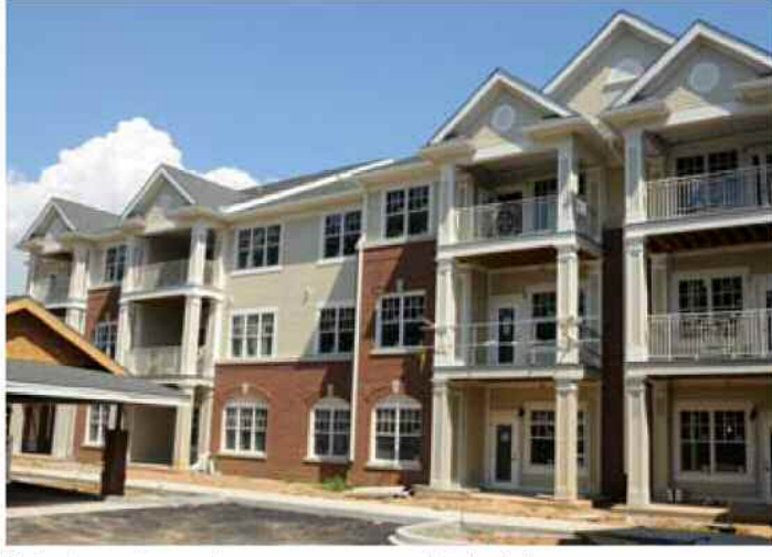
Balconies, patios and carports are among Miralea's features.

Under construction for more than a year, Miralea includes 90 apartment residences, 12 patio homes, aquatics center, two dining venues, fitness center, staff offices and grand lobby. Along with valet parking, room service and other five-star amenities, Miralea residences are equipped with the latest technology, including an e-Concierge iPad and wireless Internet.