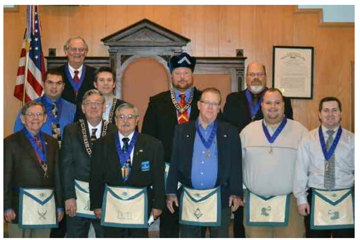
Lewis-Parkland Lodge Officers for 2013