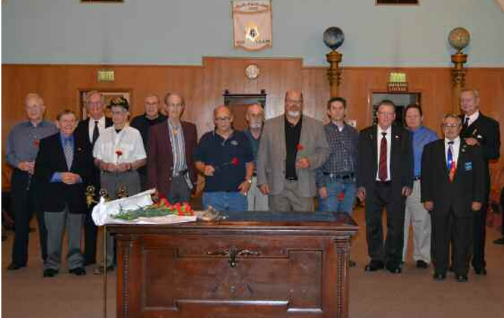
Pictured above are the Past Masters of Lewis-Parkland Lodge 638 who attended Past Masters night