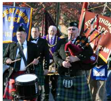
Robert Burns Lodge No.163 and Ft. Thomas No. 808 carried their banners in the parade.