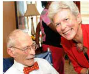
Masonic Home of Shelbyville celebrated National Nursing Home Week with a Senior Prom, complete with Big Band music and dancing. The event launched Masterpiece Living—a successful aging program now available at both the Louisville and Shelbyville campus.