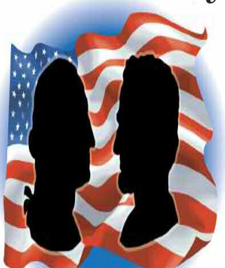
February 17 2014