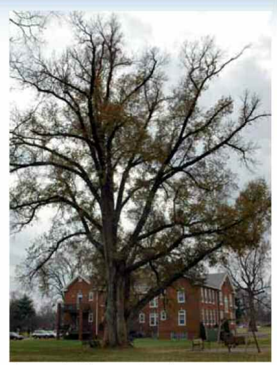
A majestic Red Elm on the Louisville is the largest of its species in the state, and may be the biggest in the nation.

Our tree is recognized among Kentucky's Champion Trees at http://forestry.ky.gov/ChampionTrees. The Red Elm is on its way to being named the largest Red Elm by American Forests' National Register of Big Trees, scoring a total of 392.63 points. Currently, the largest Elm of this species, located in Indiana, scored a total of 382 points.