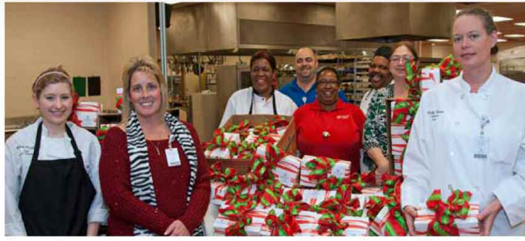
Hospitality Services staff on the Louisville campus baked nearly 4,000 cookies for the City of St. Matthews Light Up. St. Matthews event.

Kitchens on the Louisville campus jumpstarted the holiday festivities by baking nearly 4,000 cookies to delight the crowd expected at the annual Light Up St. Matthews event.