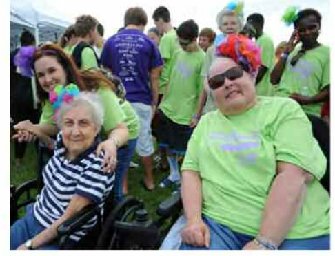
Resident-made fascinators were worn by residents and staff on the Memory Marchers team.