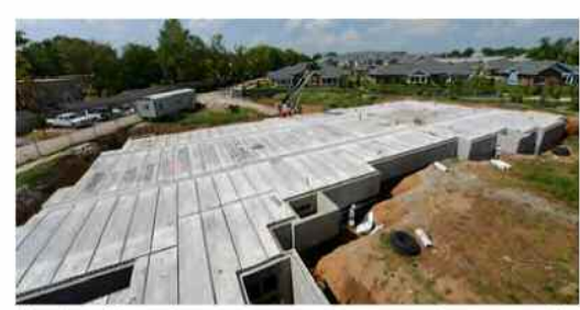
Miralea Phase II construction continues above ground. The foundation and underground parking garage area are complete. The 30 additional units are pre-sold and expected to open in spring 2015.