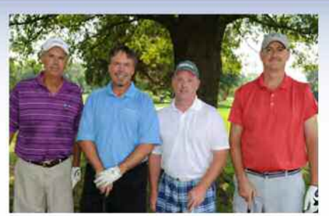
The Med Care Pharmacy team was unbeatable and captured the tournament's top honors.

Sproutlings thanks all participants who made the day a success, with extreme gratitude to premier sponsor Medline Industries Inc. We also extend grateful appreciation to sponsors Greystone Communities, Med Care Pharmacy, Bosse Mattingly Constructors, BB&T Bank, and Siemens.