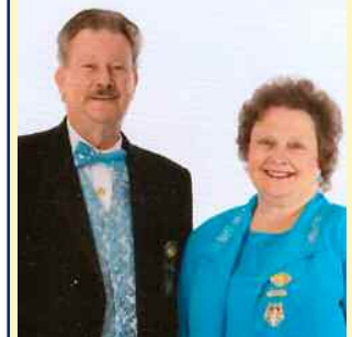
Worthy Grand Patron I = Inspection CV=Courtesy Visit