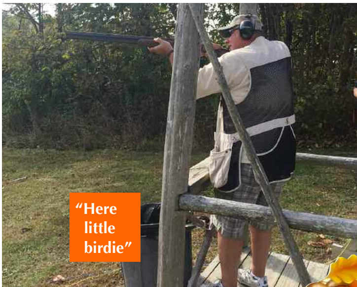
"Here little birdie"