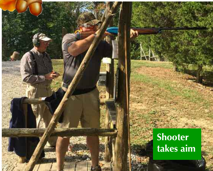
Shooter takes aim