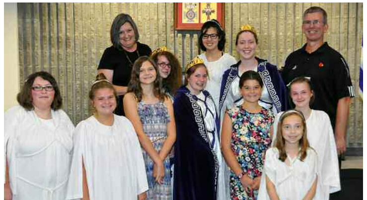
Job's Daughters, Bethel #18 had the privilege to initiate two new Daughters to the Bethel on Friday, August 26, 2016. Also, two Daughters from Bethel #42 came out to assist in the initiation. It was a great night for the Bethel, with many guests and family members in attendance.