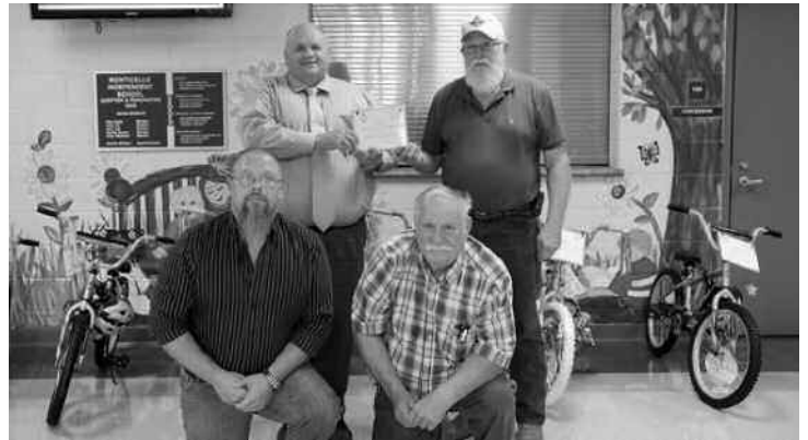
Monticello Lodge No. 431 donated four bicycles to four proud students of Monticello Elementary for excellent attendance.