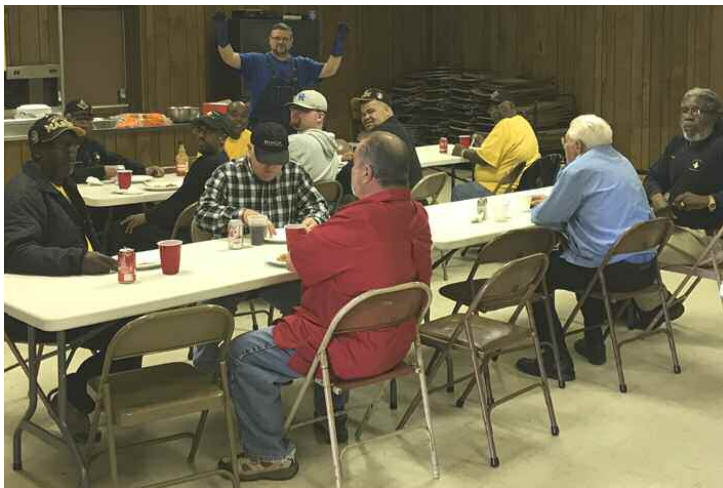
Henderson Lodge No. 958 enjoyed fellowship with St. John Lodge No. 4. It was great breaking some bread with our Brothers from Prince Hall! A great time of Masonic fellowship was enjoyed by all the Brothers in attendance.