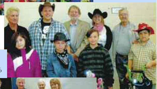
Meadowland Elementary November 18, 2016