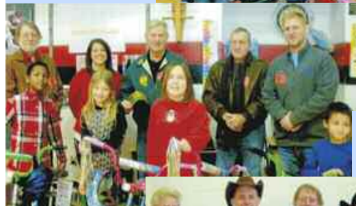
Cravens Elementary December 16, 2016