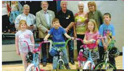
Sutton Elementary November 18, 2016