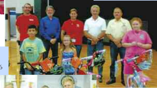
Eastview Elementary September 15, 2016