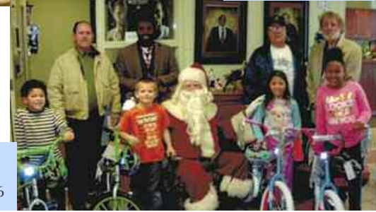
H. L. Neblett Center November 22, 2016