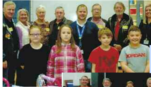
Audubon Elementary December 2, 2016

Congratulations to the Brothers of Ensor Lodge No. 729, in District #7. They have made donations of thirty-two (32) bicycles given to eight local schools for incentives for the students to strive for perfect attendance. Ensor Lodge has additionally given $1,500 between two schools for shoes and supplies during the school year, and other activities for seniors and children, and still had enough money for a new roof for the Lodge. It's a great way to show, if you try , sometimes you get more than you could imagine.