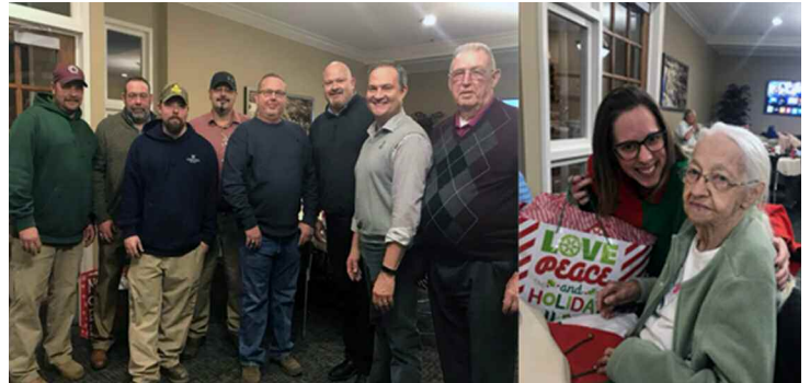
The Masonic Homes of Kentucky Lodge No. 967 held a Christmas party including dinner and gifts for the residents of Masonic Homes.