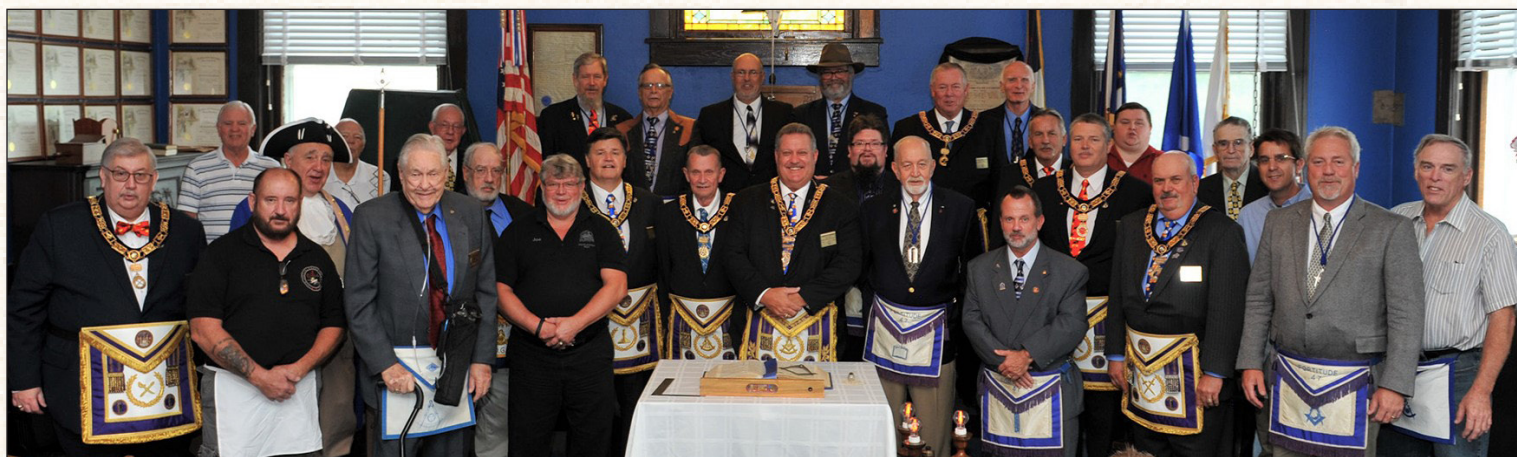
On Saturday, September 8, 2018, Fortitude Lodge No. 47 F&AM celebrated their 200 year anniversary. Along with public officials, family and friends, the Grand Lodge of Kentucky officers celebrated with the brothers of Fortitude!