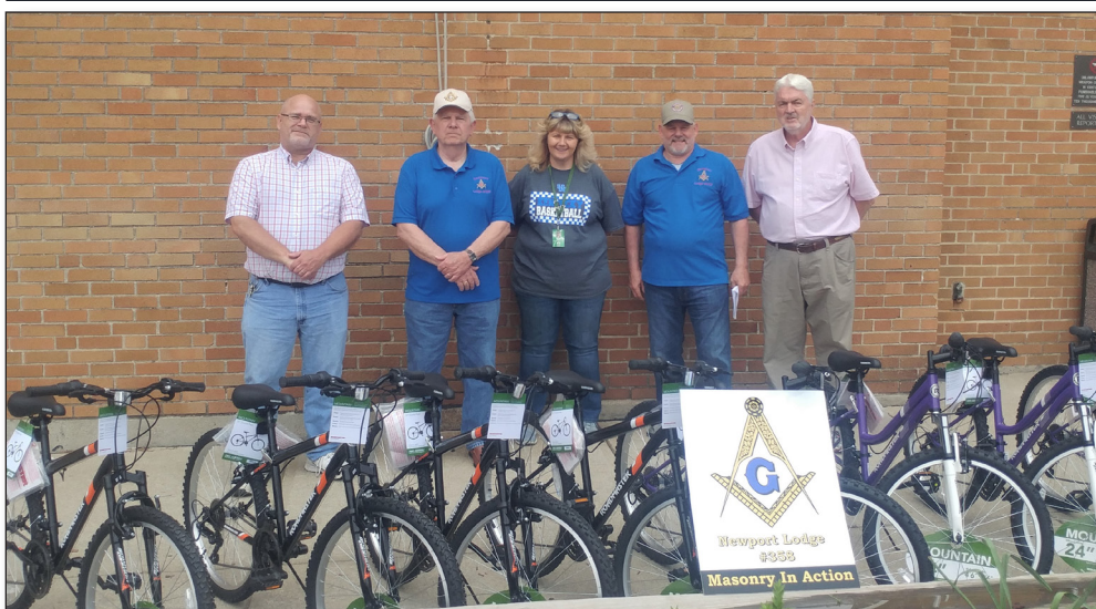
Newport Lodge #358 presented a total of 20 mountain bikes to Newport Intermediate school. Every student with perfect attendance was presented with a bike. Newport Lodge #358 also presented Lincoln Elementary in Dayton Kentucky with 8 bikes. With Ft. Thomas Lodge #808 donating 8 bikes and the Principle, teachers, and staff donating an additional 4 bikes every student with perfect attendance was presented with a bike.