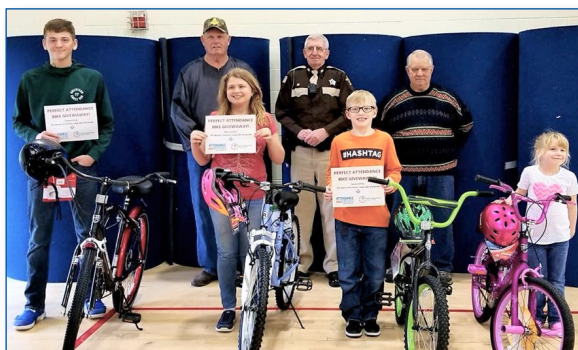
March 28, 2018: Congratulations to these four students of North Washington Elementary School in Willisburg, Kentucky, who are winners of a brand new bike and helmet! All students with perfect attendance were entered into the drawing. The bikes were donated by the Emulation Lodge #688 of Sharpsville, Kentucky.