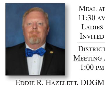
Meal at 11:30 ам LADIES INVITED DISTRICT MEETING AT 1:00 рм