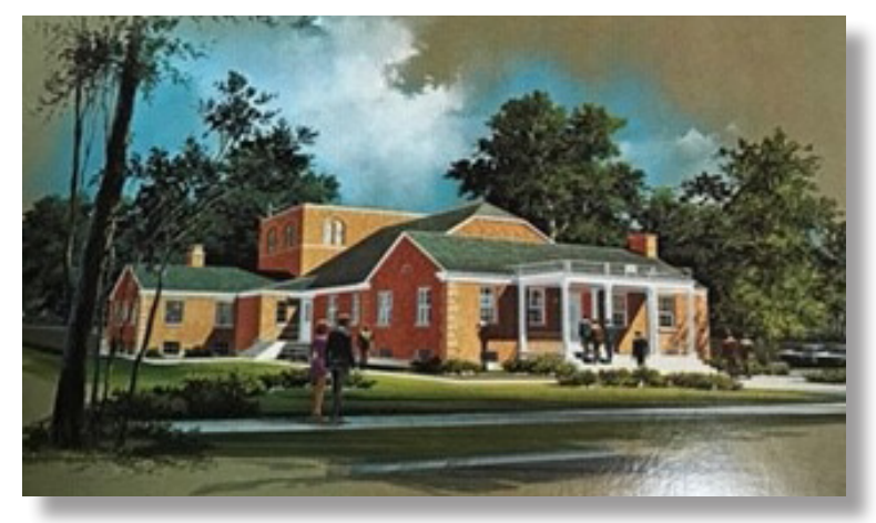
Current Location of Scottish Rite Lexington Consistory #4 553 Rosemont Garden, Lexington KY Meets 3rd Thursday of each month, dark Jan/Feb

December 5, 1977: Payments completed on Building