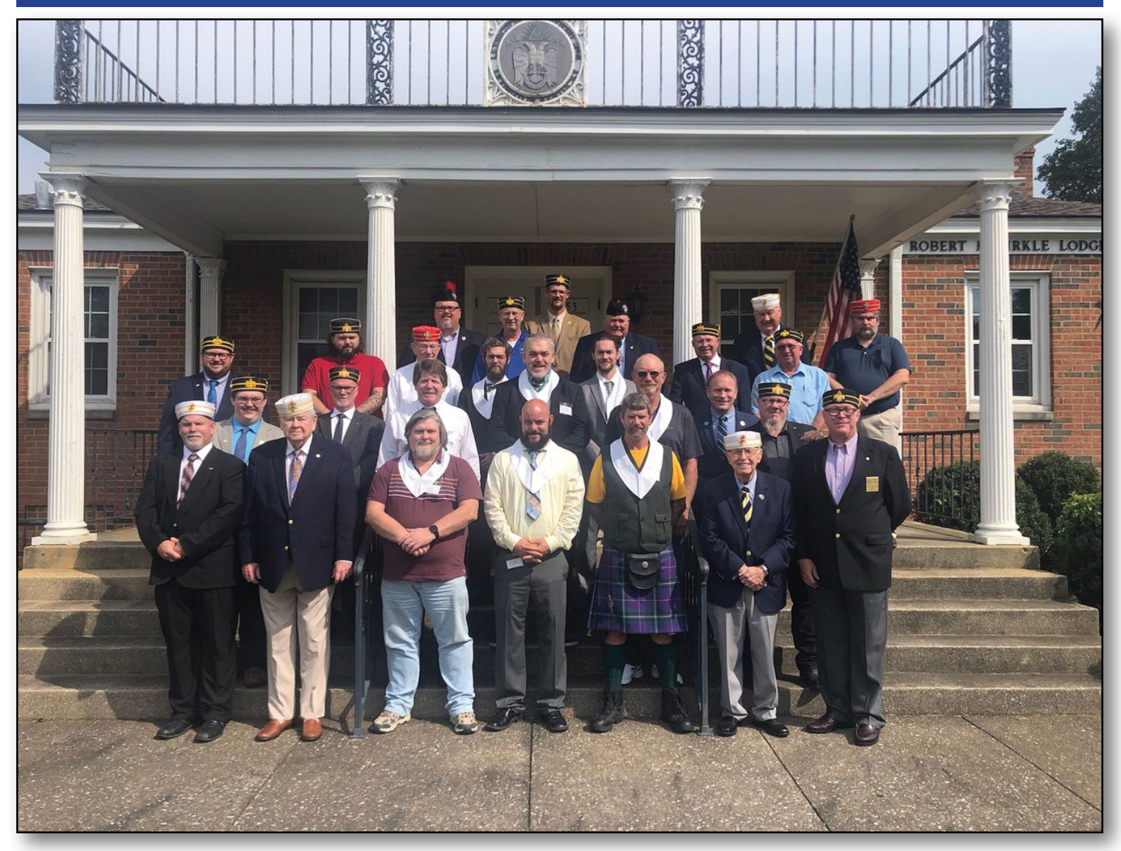
Valley Of Lexington Reunion, October 2, 2021