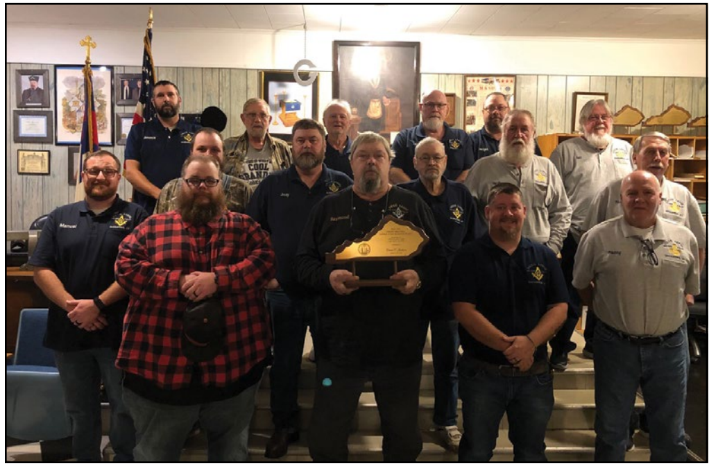
Vicco Lodge #929 F&AM with their 2021 proficiency award.