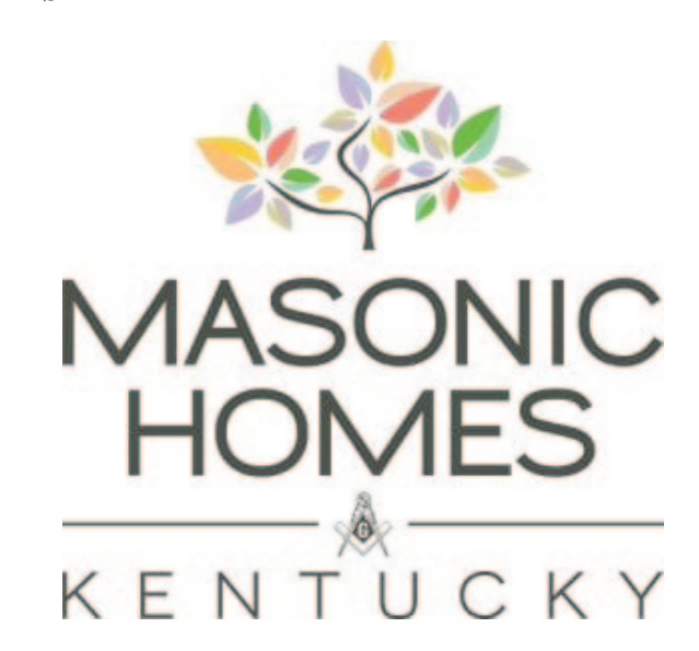
A program to support Masonic Homes Kentucky's