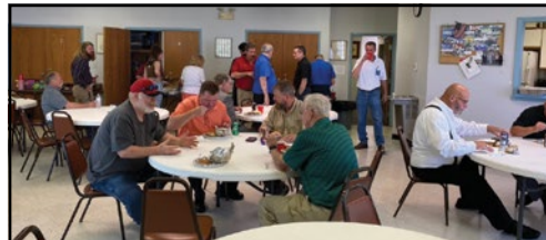
Pictures from the Military/First Responder cookout held at River City Lodge #966 on June 4th.