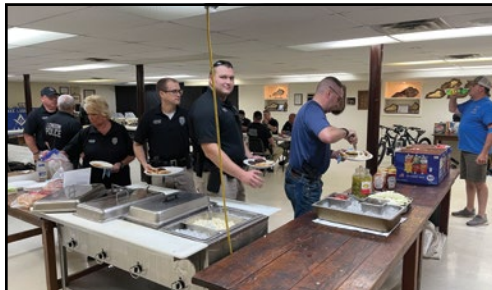
McKee #144 host blood drive and first responders dinner May 27, 2022.