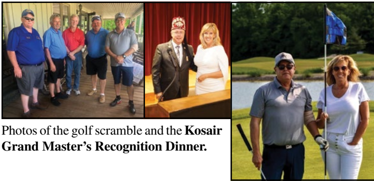
Photos of the golf scramble and the Kosair Grand Master's Recognition Dinner.