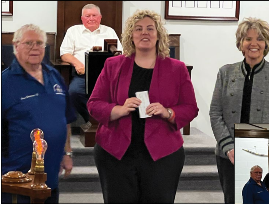
On September 13, 2022 during Past Masters Night at Boaz Masonic Home Lodge #850 we were honored to present $1000.00 to the scholarship funds of both the Kentucky International Order of the Rainbow for Girls and the Kentucky Order of DeMolay.