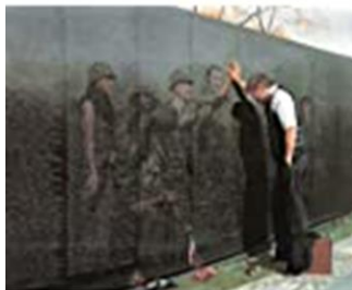
27 January 1973

Veterans Committee working in the Community