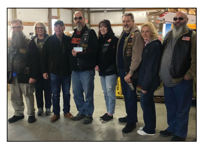
The Bluegrass Ashlars chapter of the Kentucky Widows Sons was fortunate enough to raise $3300.00 and donate it to the WJCR Food Ministry. This food outreach program reaches out to several counties in KY and feeds around 1200 families a month. With this donation, WJCR is able to buy over 21,000 lbs of food!! This donation allows these families to have a stronger sense of stability and peace of mind knowing they don't have to worry about their next meal. If you would like to make a donation to this wonderful ministry, make your checks payable to WJCR FOOD MINISTRY, PO BOX 91, Upton KY 42784.