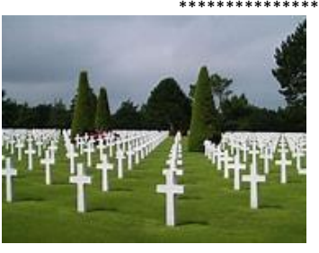
30 May - Memorial Day A day to commemorate all who died in military service for the United

21 May 2022 - Armed Forces Day A day to pay tribute to men and women who serve in the United States' Armed Forces.