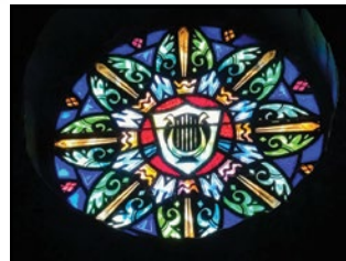
Stained Glass Window from St. Paul's Episcopal Church located in Williamson West Virginia

Outside the church, high in the autumn sky, the sun shines bright each day with a uniform radiance, but once the rays pass through the stained panes of the windows, they transition into hues of blue or green, red, white, or yellow. Much is the same concerning our faith in, and worship of, the Creator. We, as Freemasons, are unified by our shared belief in a Supreme Being, who provides both the physical and spiritual light by which our world is illuminated. Regardless of which form your faith takes, be you Christian, Hindu, Muslim or Jew, the stained glass from St. Paul's reminds me that you are exemplifying the light of the Grand Architect of the Universe through the practice of your respective faith traditions, generally centered on a love and respect for the Creator, your fellow man, and yourself. Early on in our journey as Freemasons, more particularly, on the first night we enter the Craft, we are admonished regarding our masonic duty with respect to these principles.