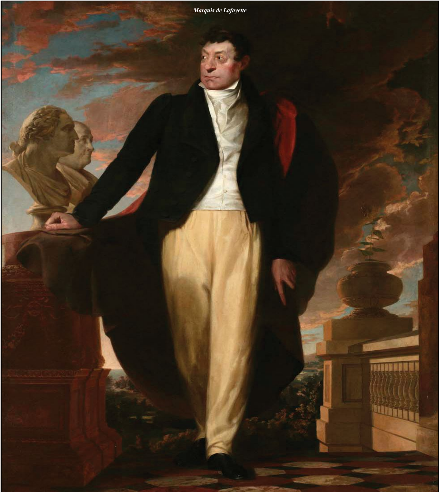
Marquis de Lafayette