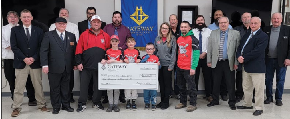
Gateway Lodge #109 distributed $7,200 in donations to three organizations, supporting the community our Lodge calls home. On February 12th, $3,000 was donated to the Emergency Shelter of Northern Kentucky, supporting their work with the homeless. On February 20th, $1,200 was donated to the Covington Bulldog baseball program, supporting seven youth baseball teams, and on March 18th, $3,000 was donated to the Covington Independent Public Schools resource centers, supporting schools and families with many needs ranging from food to clothing.