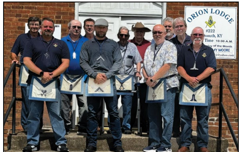
The Brothers of Orion Lodge #222 completed the Grand Master's Masonic Scholars Academy during their July stated communication.